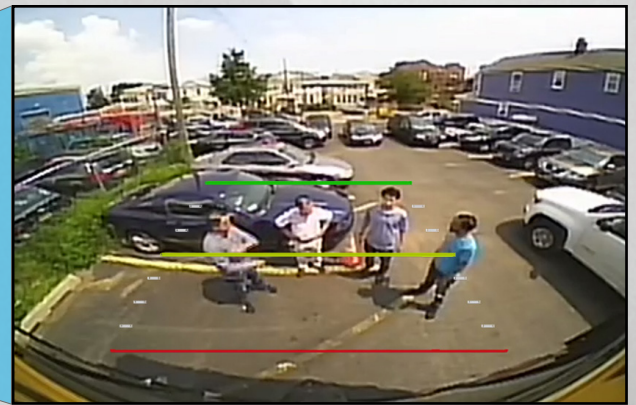
Enlarged view of rear of the bus.